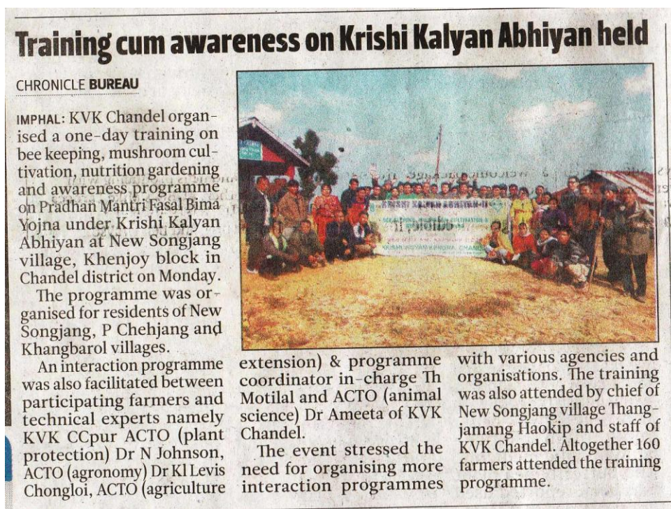
Training programme on bee keeping, nutrition garden, mushroom cultivation and PMFBY under KKA-II (The People Chronicle 6.11.18)