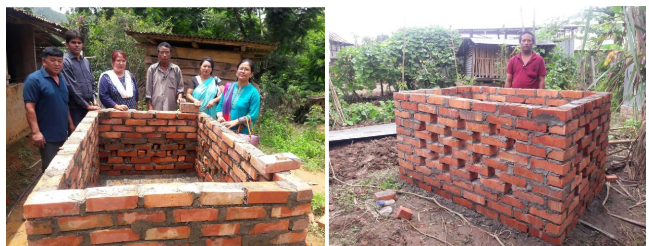
Fig. Monsangpantha village