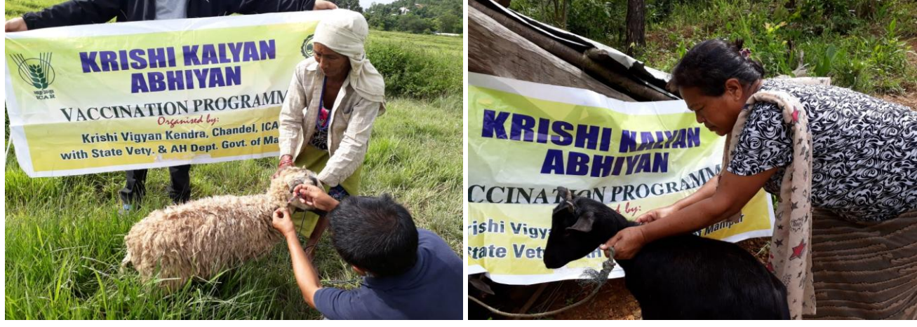
Fig. Panchai village