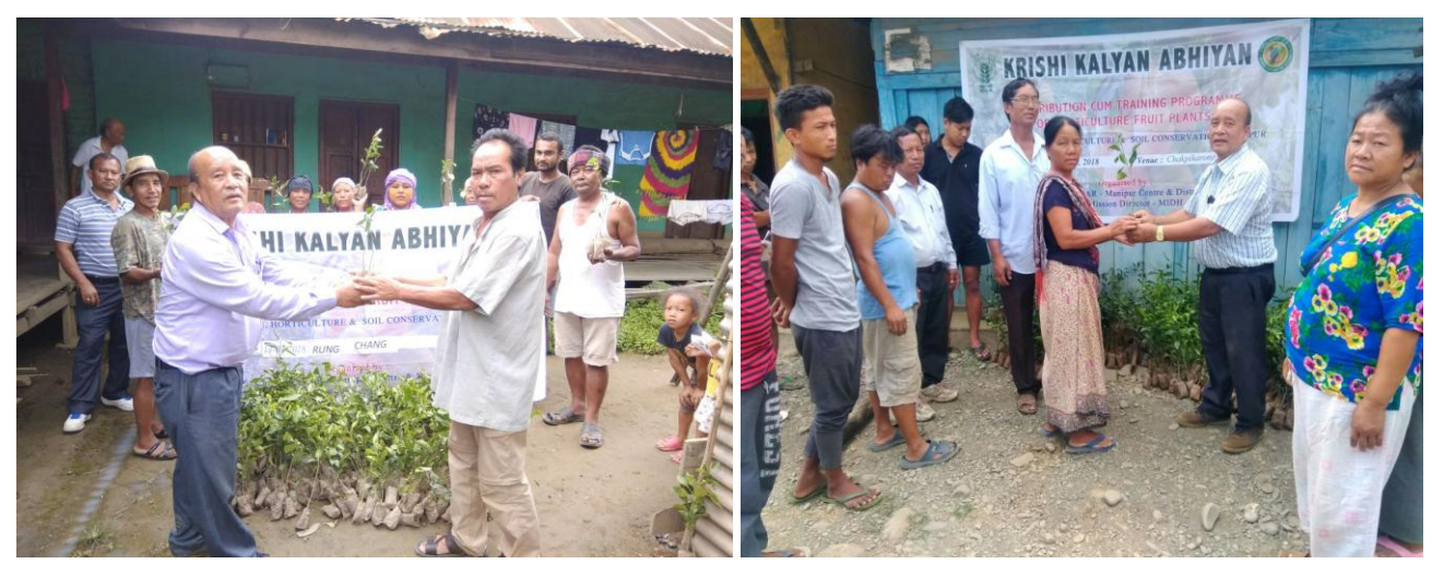
Fig. Rungchang village