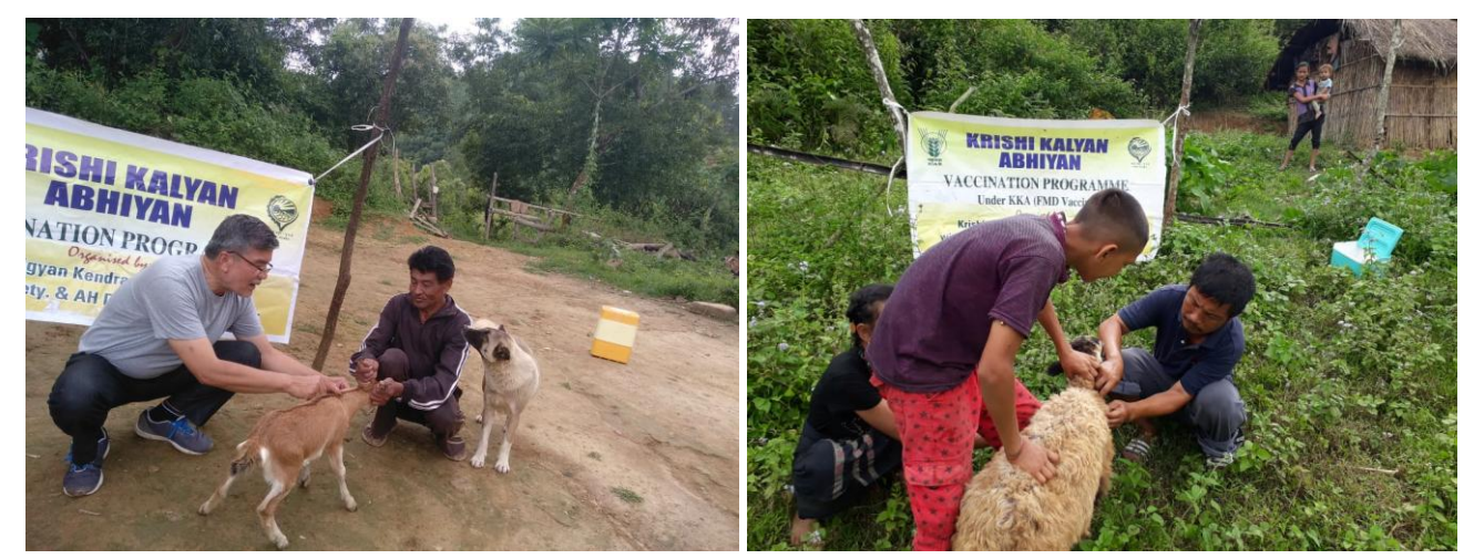
Fig. Lambung village