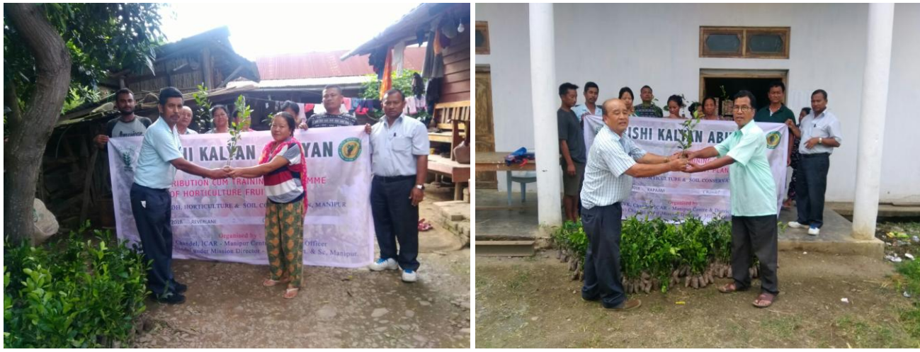
Fig. Riverlane village