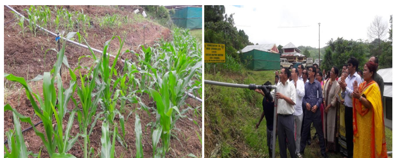
Fig. Demonstration of Mini Sprinkle (Micro irrigation) 16/7/18