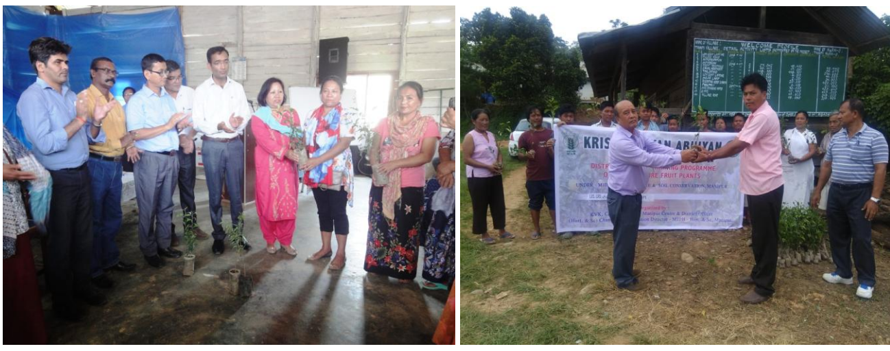
Fig. Lambung village