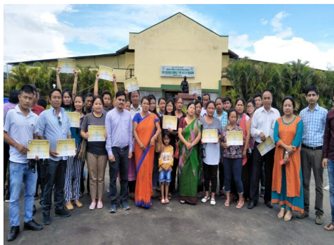
Fig. Mushroom cultivation (21 – 23/6/18)