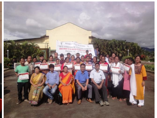
Fig. Mushroom Cultivation (20-21/7/18)