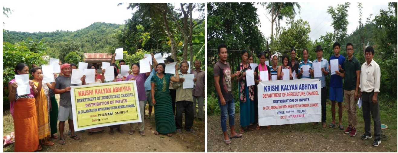
Fig. Phunansambum village