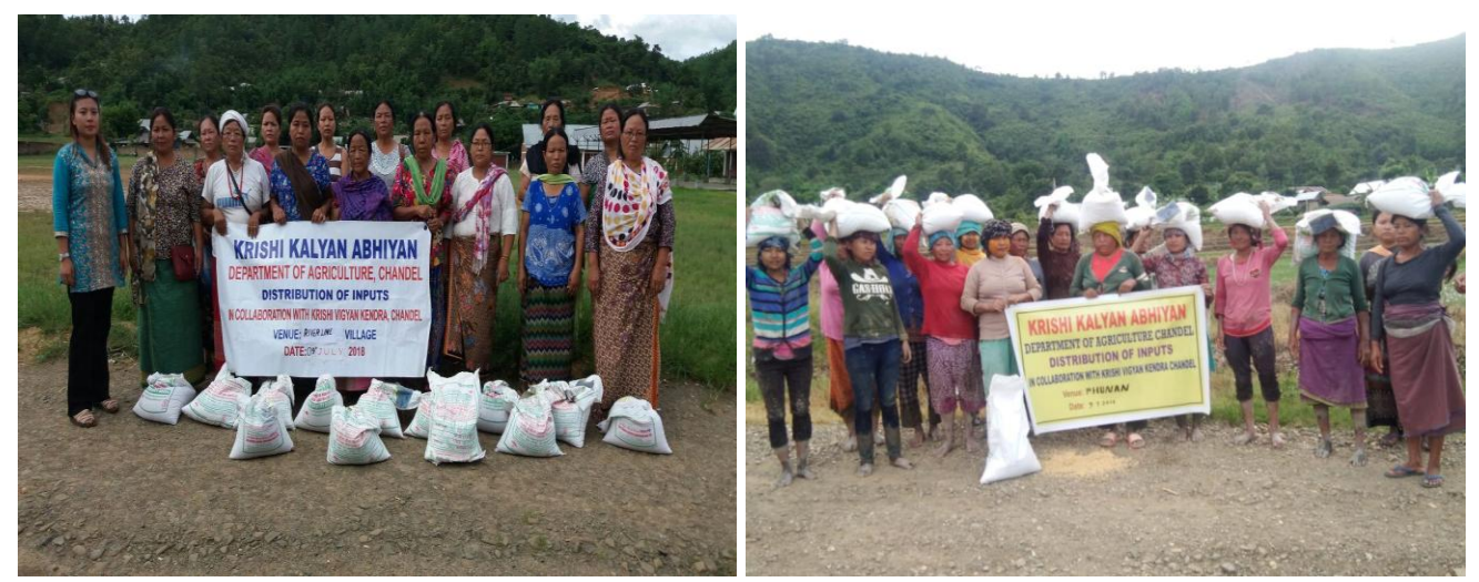
Fig. Riverlane village