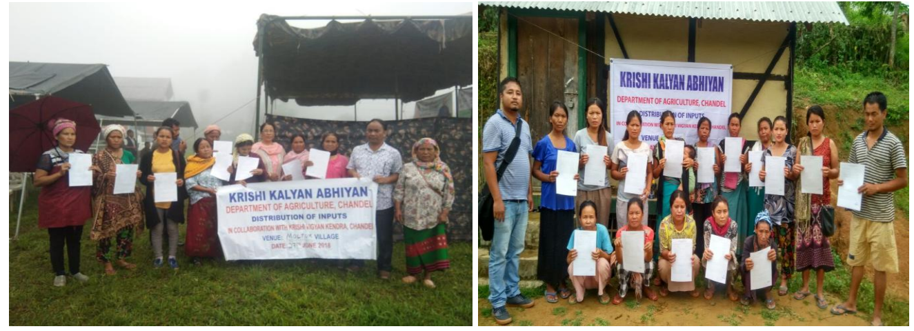
Fig. Moltuk village