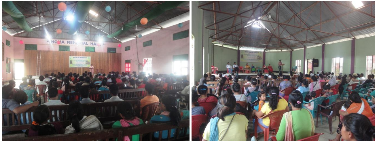
Fig. Kapaam village