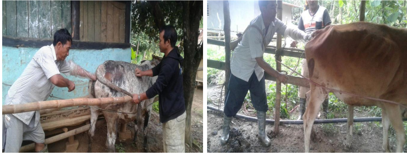
Fig. Purumtampak village