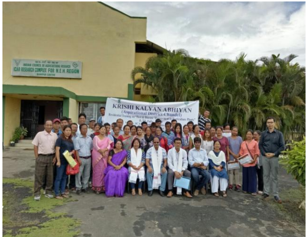
Fig. Pest and Disease Management in Horticultural (05 - 07/7/18)