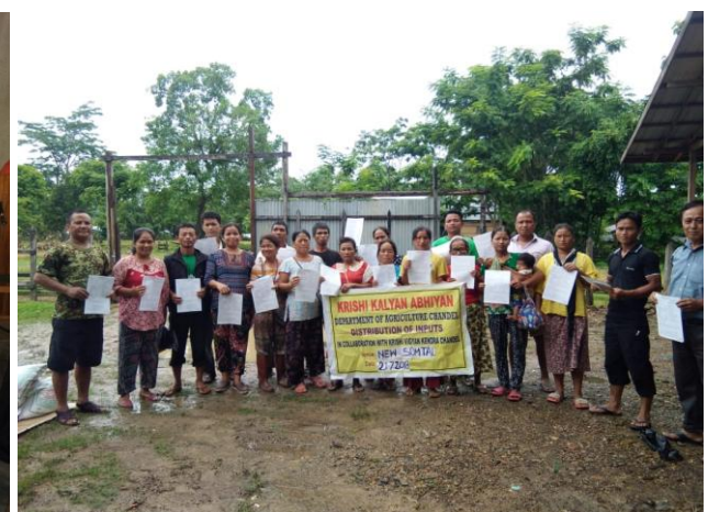
Fig. New Somtal village