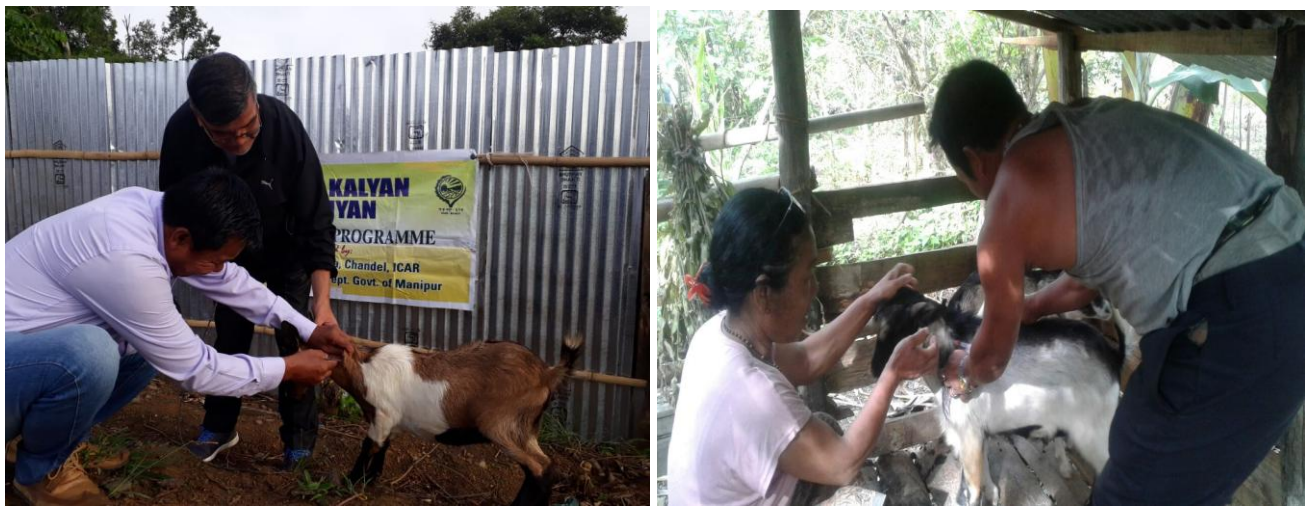
Fig. Mantak village