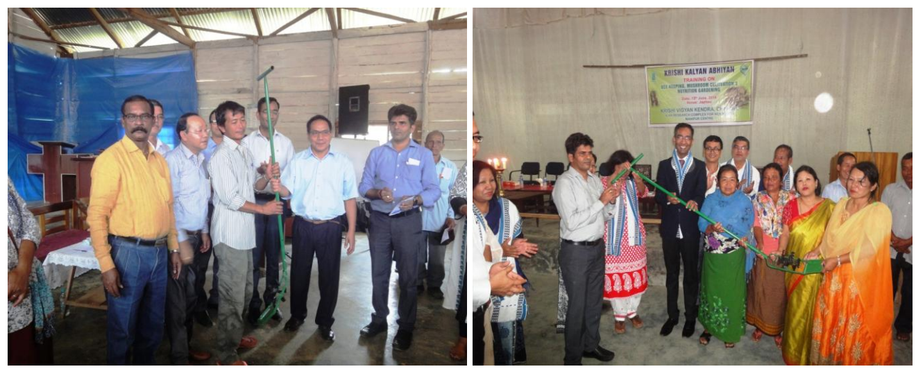
Fig. Lambung village