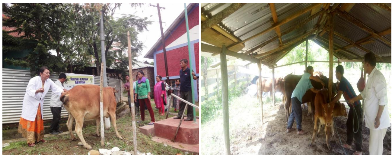
Fig. Japhou village