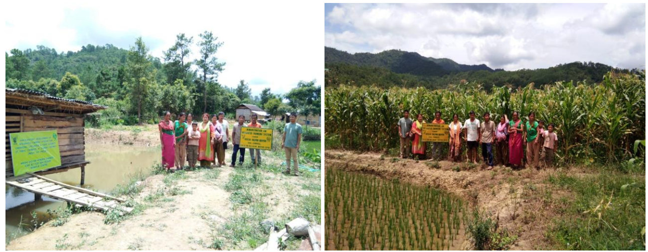
Fig. Demonstration of Integrated Cropping Practice 9/8/18