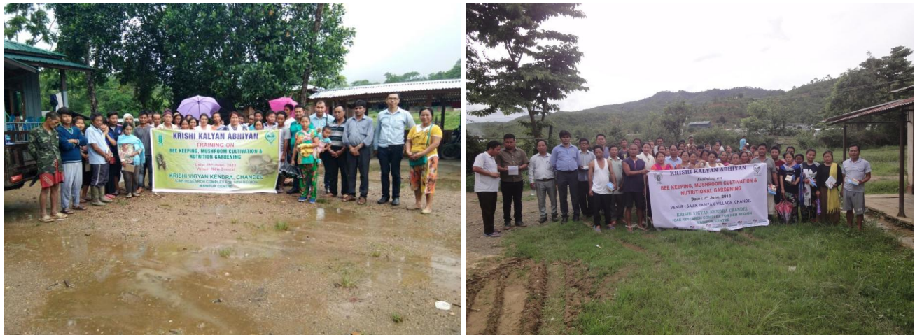
Fig. New Somtal village