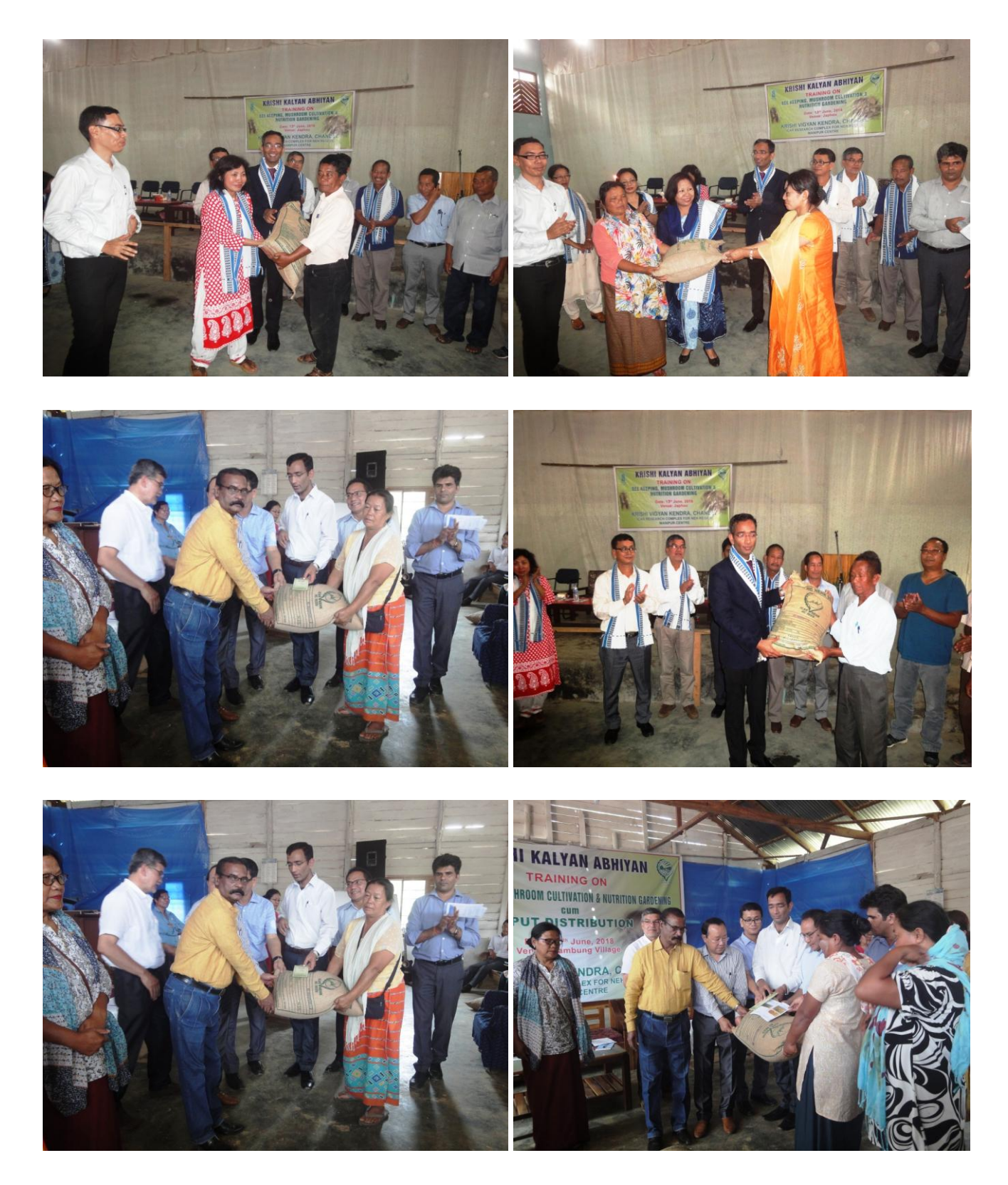
Fig. Paddy and groundnut mini kits were distributed by dignitaries in Japhou and Lambung village, Chandel.