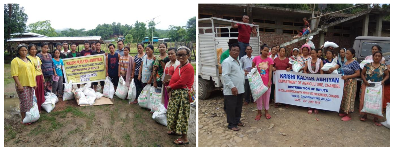
Fig. New Somtal village