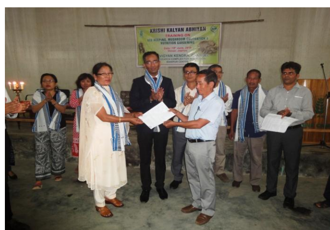
Fig. SHC distributed by dignitaries at Japhou