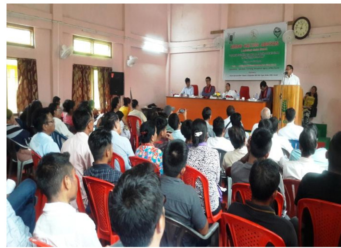
Fig. Production of Kharif oilseeds and cereal for grain and seed (16 - 18/7/18)