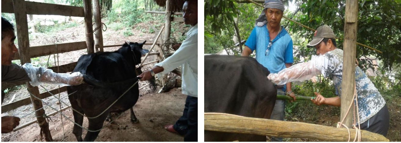
Fig. Aihang village