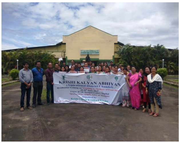
Fig. Planting technology of fruit plants (28 – 30/6/18)