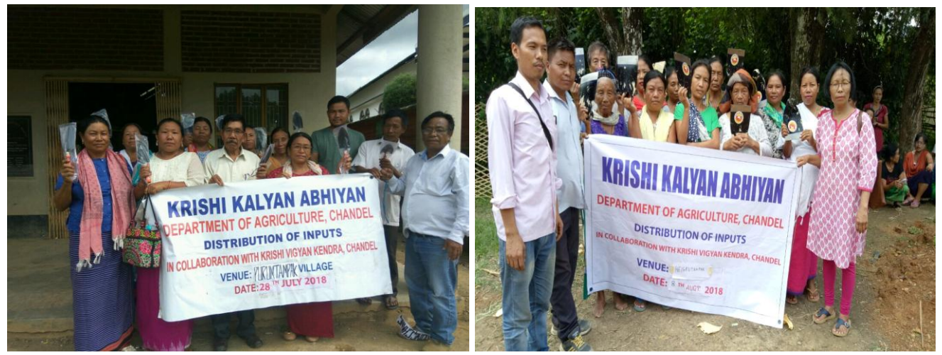
Fig. Purum Tampak village