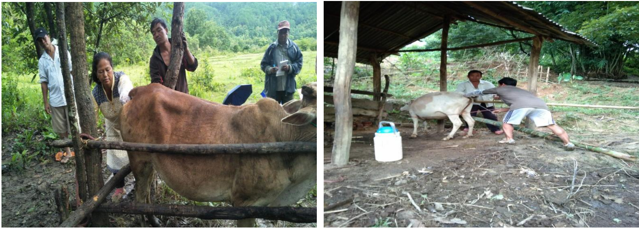
Fig. Kanankhu village