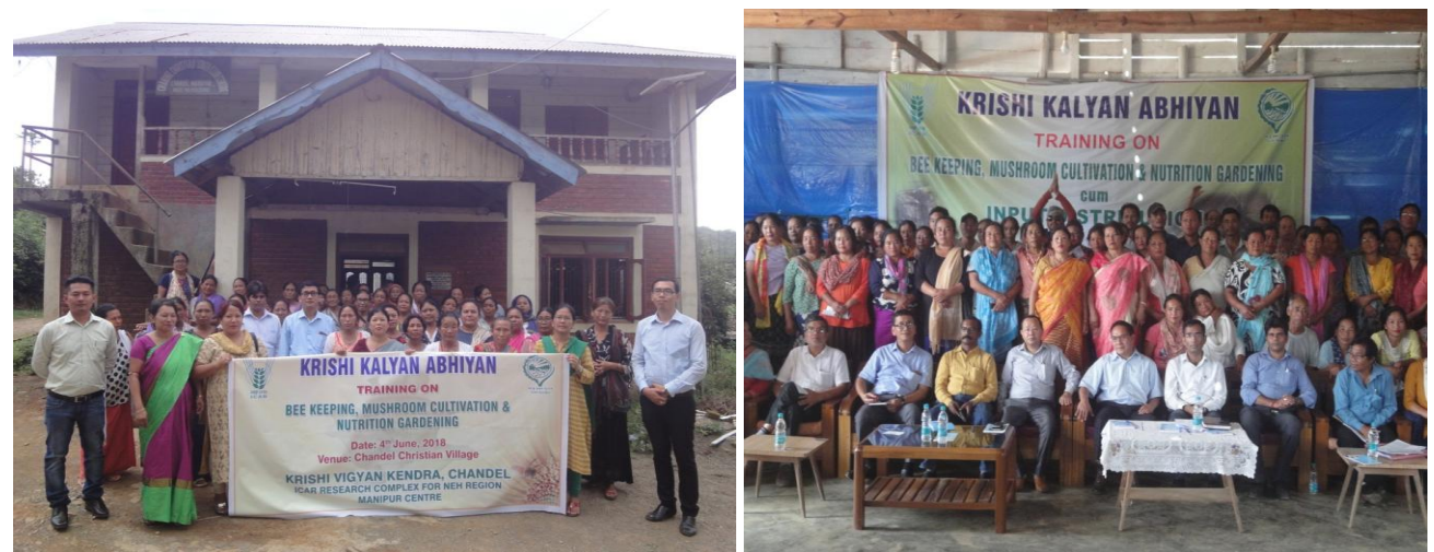
Fig. Chandel Christian village