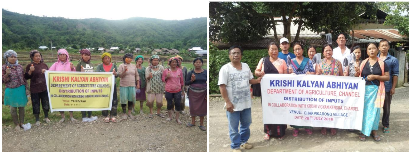
Fig. Phunan Sambum village