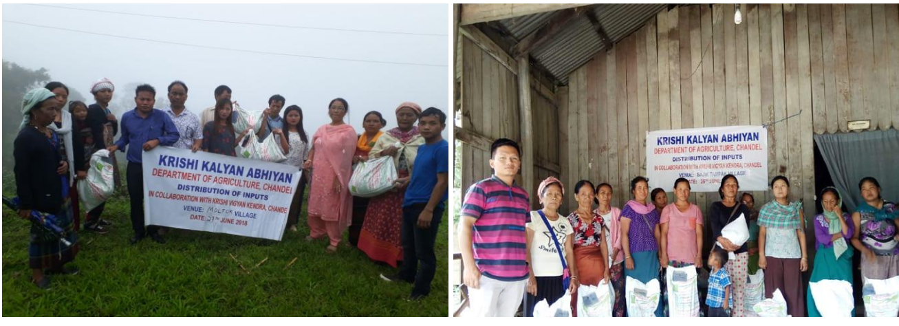
Fig. Moltuk village