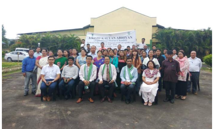
Fig. Nursery management of fruit and vegetable crops crops (02 - 04/7/18)

Fig. Planting technology of fruit plants (28 – 30/6/18)