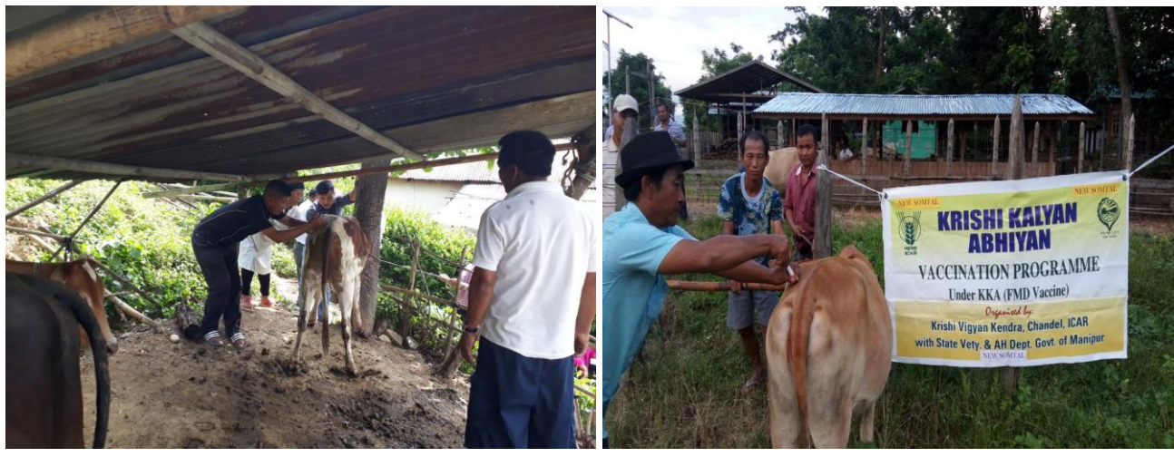
Fig. Chakpikarong village