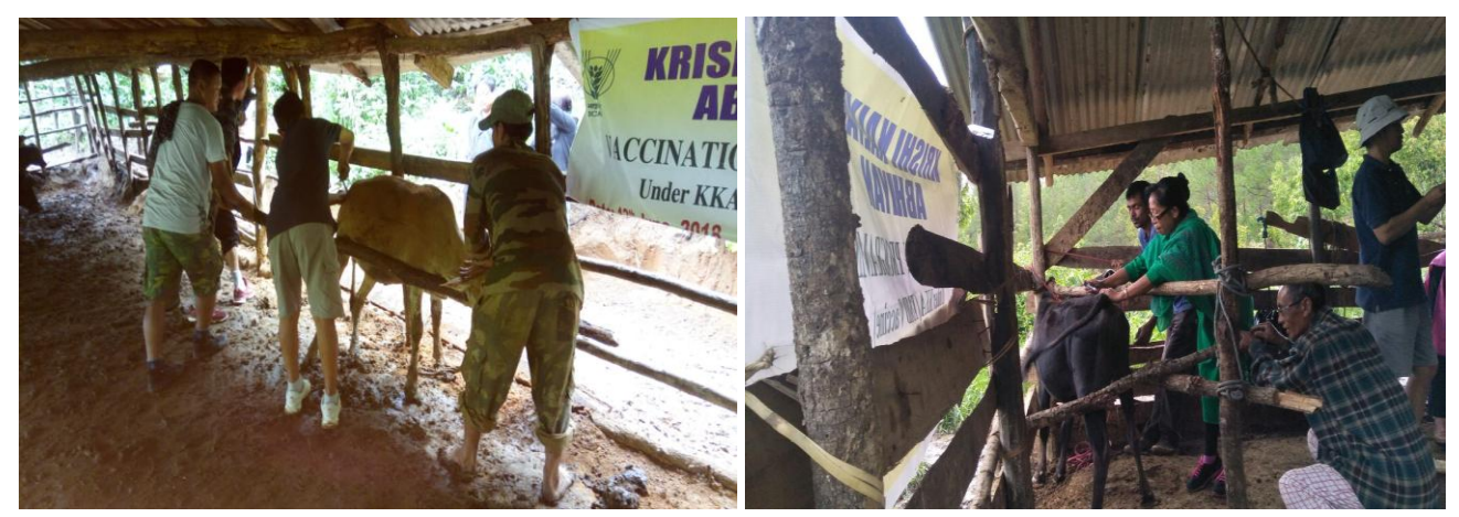
Fig. Lambung village