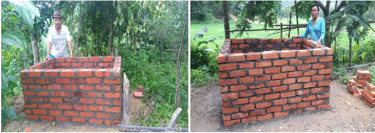
Fig. Aihang village