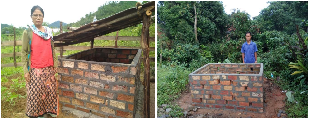
Fig. Lambung village