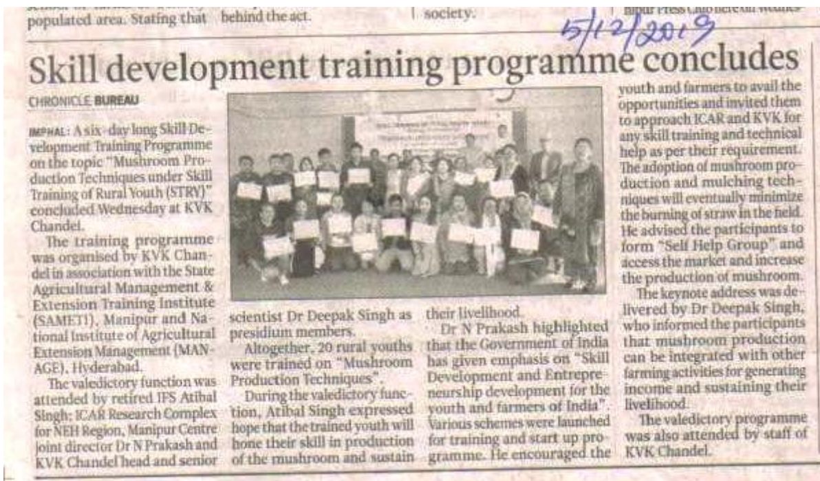
Mushroom Skill Development training for STRV (05/12/2019, The People's Chronicle)